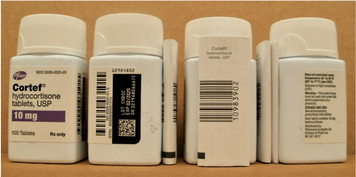
Image of the US Bottle Label